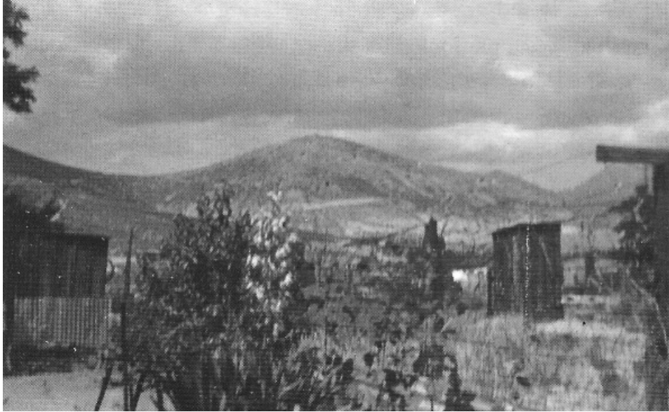
Photo taken from Lucile's back yard, looking south toward Stebbins Peak, late 1930s.